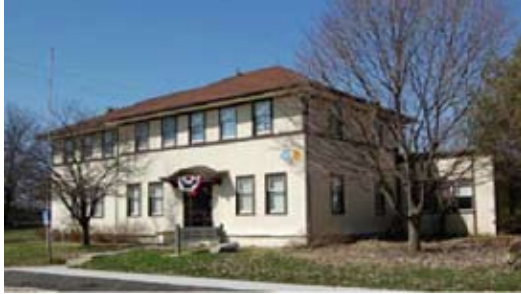
MINE RESCUE STATION, PRINCETON AVENUE