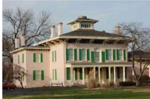
WORKER'S HOUSING ASSOCIATED WITH THE SPRINGFIELD IRON WORKS