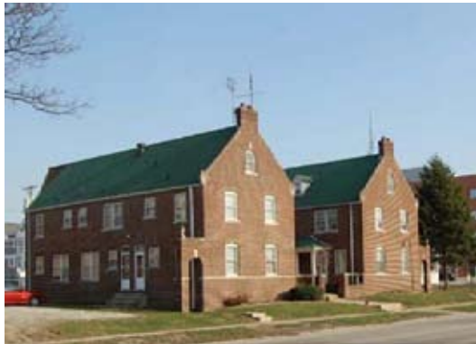
APARTMENTS, 900 BLOCK S. 5TH STREET