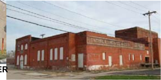
CENTRAL ILLINOIS ICE AND COAL PLANT 10TH AND JACKSON STREETS