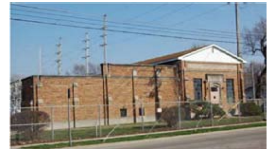
CWLP SUBSTATION SOUTH 2ND STREET

A given survey area can contain a diverse range of cultural resources within them, including single and multiple family housing, commercial and industrial properties, institutional buildings, as well as transportation and utility structures related to the city's infrastructure. Less visible, but equally significant, are the archaeological resources that may be present. These various property types illustrate the character and evolution of their associated neighborhoods and city