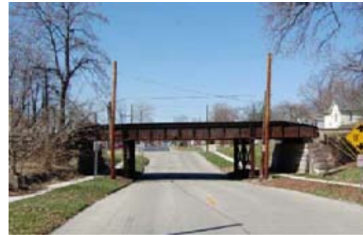
DODGE STREET VIADUCT