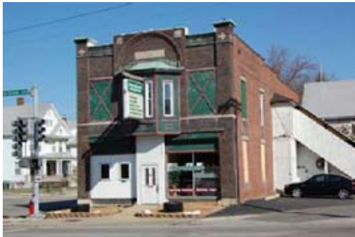
FORMER FIRE STATION NO. 4 NORTH GRAND AVENUE