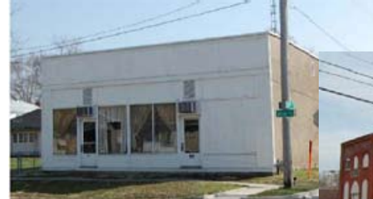
OLD STORE, SOUTHEAST CORNER OF 3RD AND ALLEN