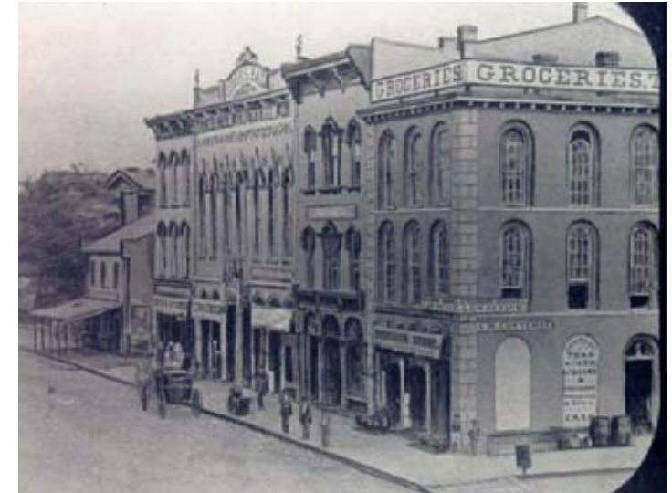
NORTH SIDE OF PUBLIC SQUARE IN 1858 (LEFT) AND 1860 (ABOVE)