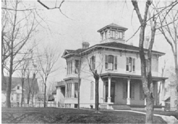
DANA HOUSE 300 E. LAWRENCE, IN 1898