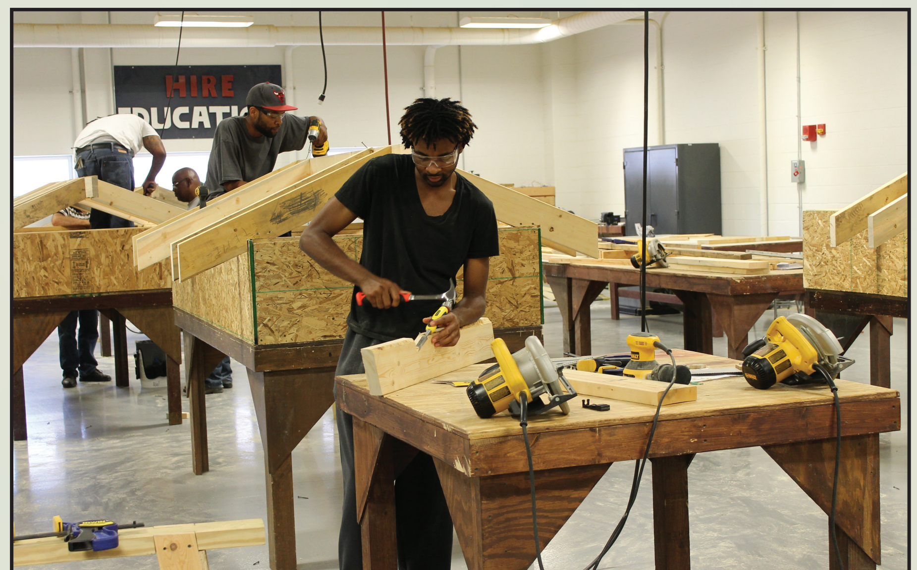
IDOT HIGHWAY CONSTRUCTION CAREERS PROGRAM