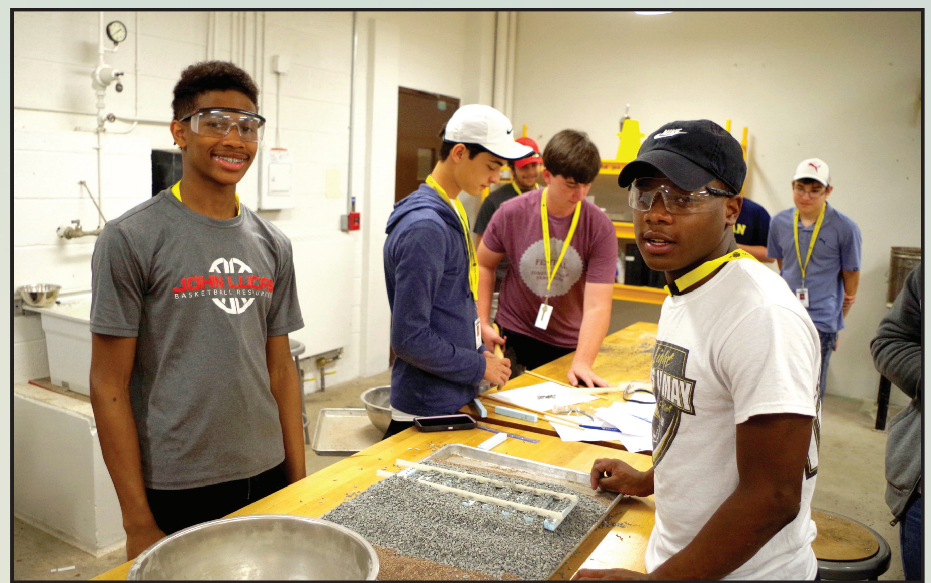
MICHIGAN TECH RAIL & INTERMODAL SUMMER CAMP