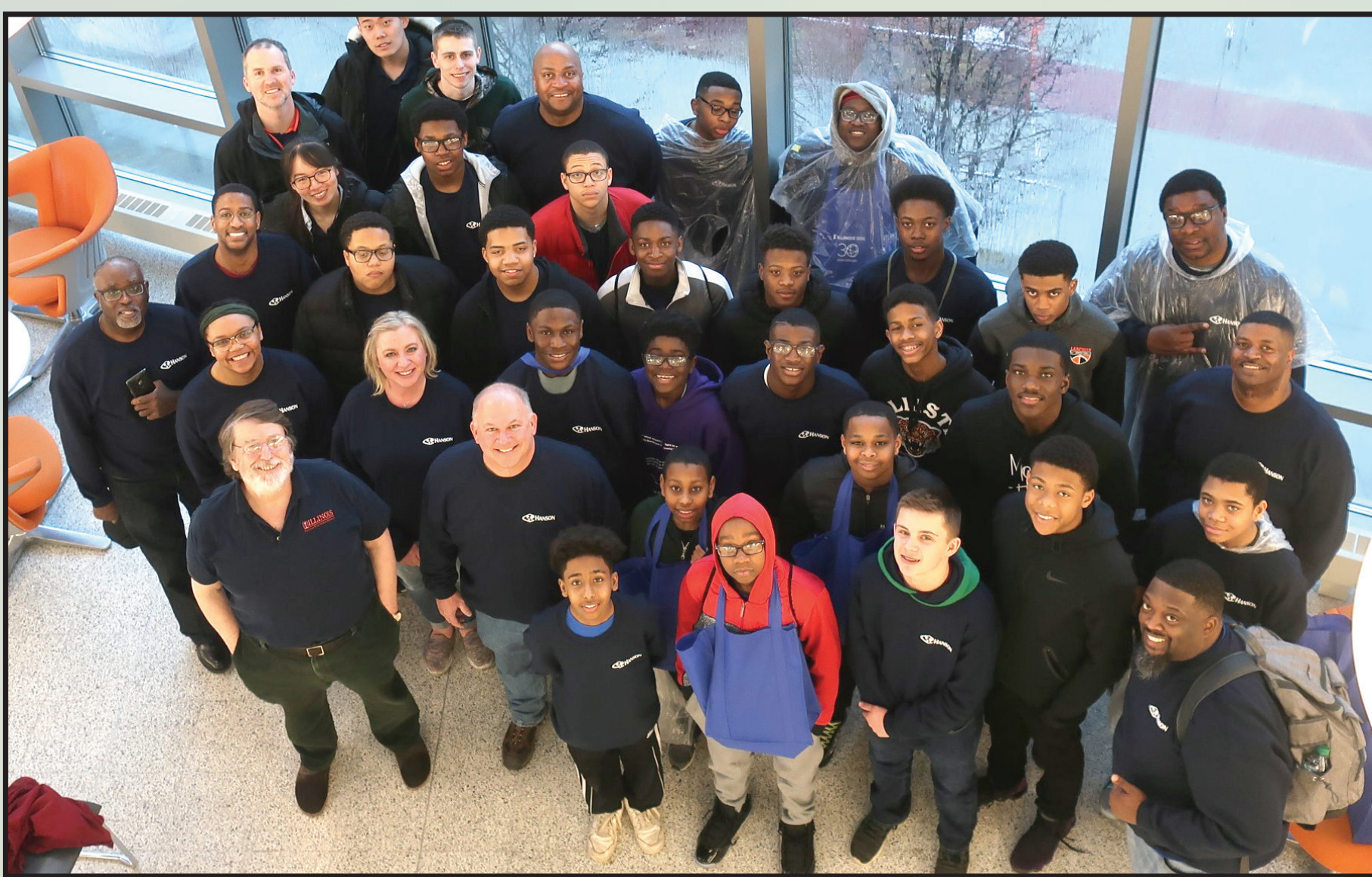
UNIVERSITY OF ILLINOIS/RAILTEC ENGINEERING OPEN HOUSE