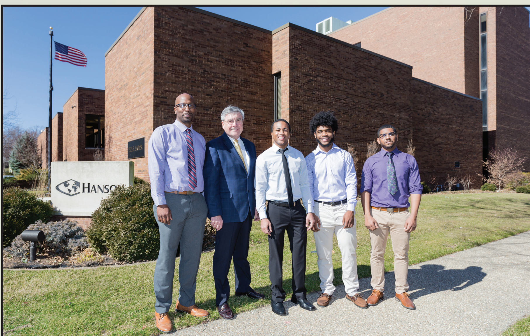
LINCOLN LAND COMMUNITY COLLEGE OPEN DOORS PROGRAM